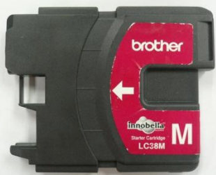
Brother's Original Inkjet Cartridge

Nippon-ink's Cartridge – LC 38 and LC 67 is the same as it had been modified that can be used in both printers and the actual cartridge is LC 67 to prevent duplication.