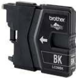
Brother's Original Inkjet Cartridge