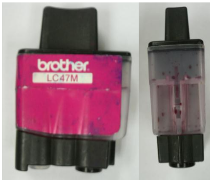
Brother's Original Inkjet Cartridge