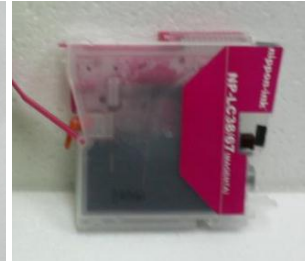
Nippon-ink's Inkjet Non- Refillable & Refillable Cartridge