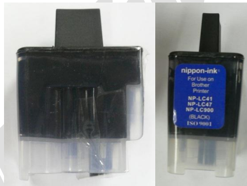
Nippon-ink's Inkjet Refillable Cartridge