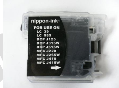
Nippon-ink's Inkjet Refillable Cartridge