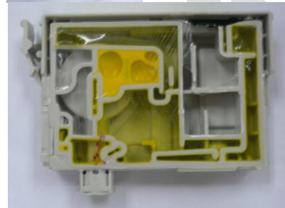
Epson 141 N Series – External & Internal

Nippon-ink stated clearly to User – In case of Void Warranty by Original, User can launch the complaint and feedback to CASE and/or MTI directly for action and investigation.