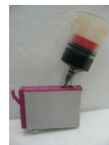
Insert Needle into the Hole and Pump slowly

All Brand Name, Logo, Trademark, Part Number, Picture, Design, Patent, Copyright and Technology belong to the respective owners in charge. It use for descriptive, illustrative, comparative and explanation purpose only. All other Rights reserved.