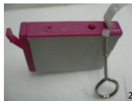
Remove Rubber Stopper