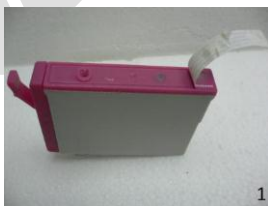
Remove Top Label

How to Refill Nippon-ink Inkjet Cartridges? Please refer to the picture below.